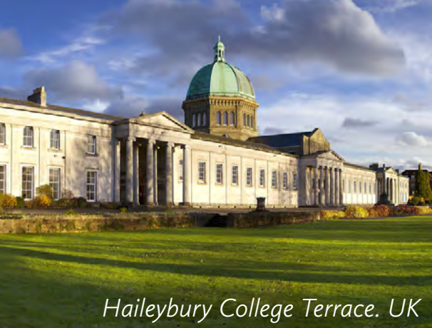
Haileybury College Terrace. UK